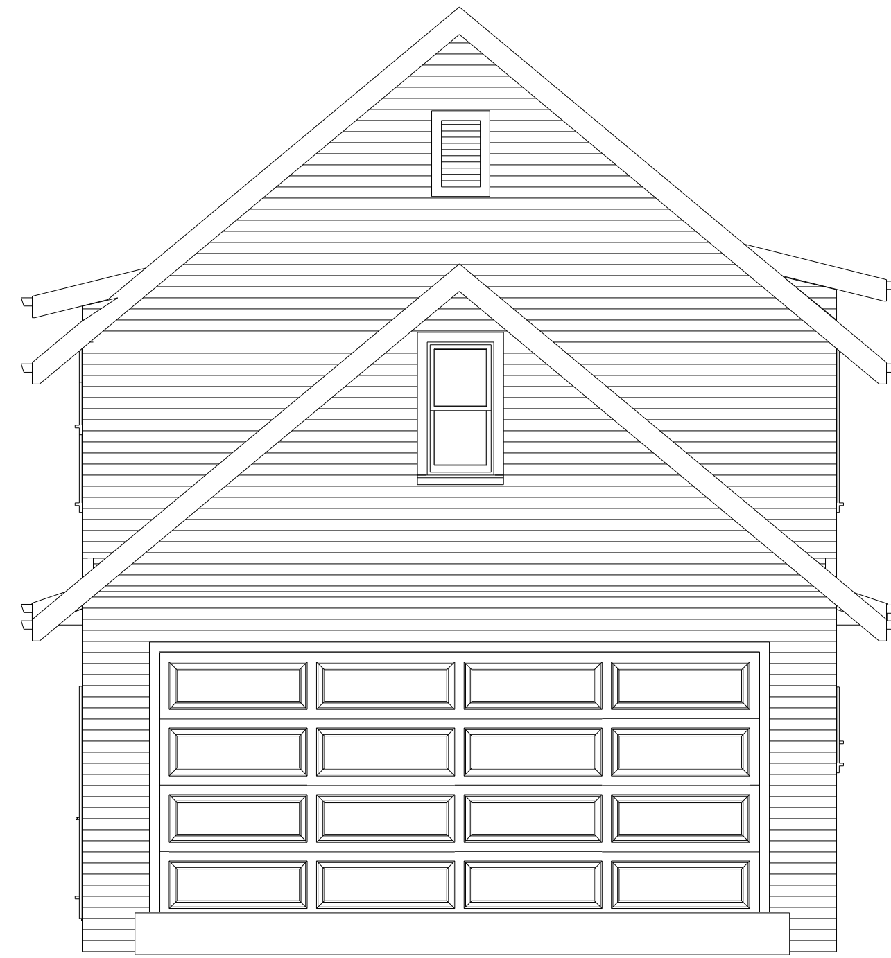
REAR ELEVATION SCALE 1/4" = 1'-0"