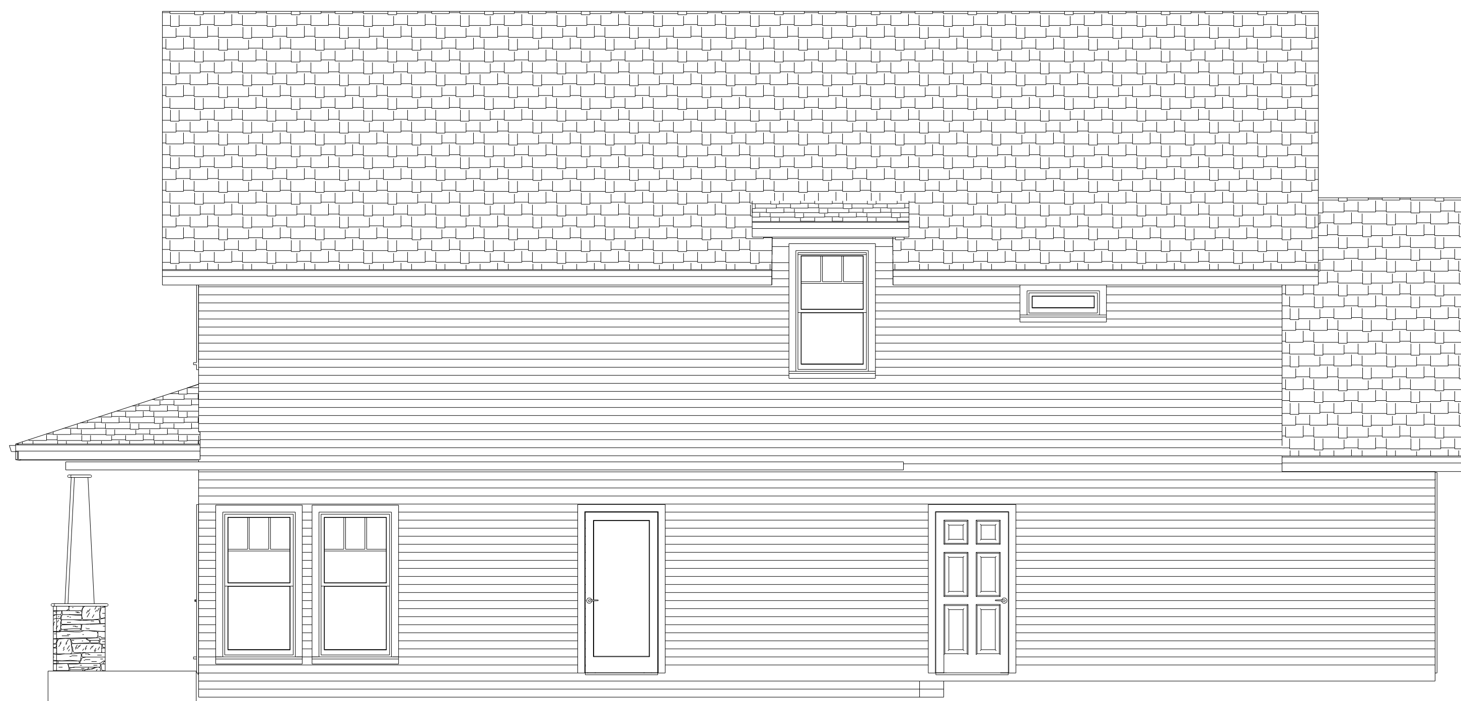
RIGHT ELEVATION SCALE 1/4" = 1'-0"