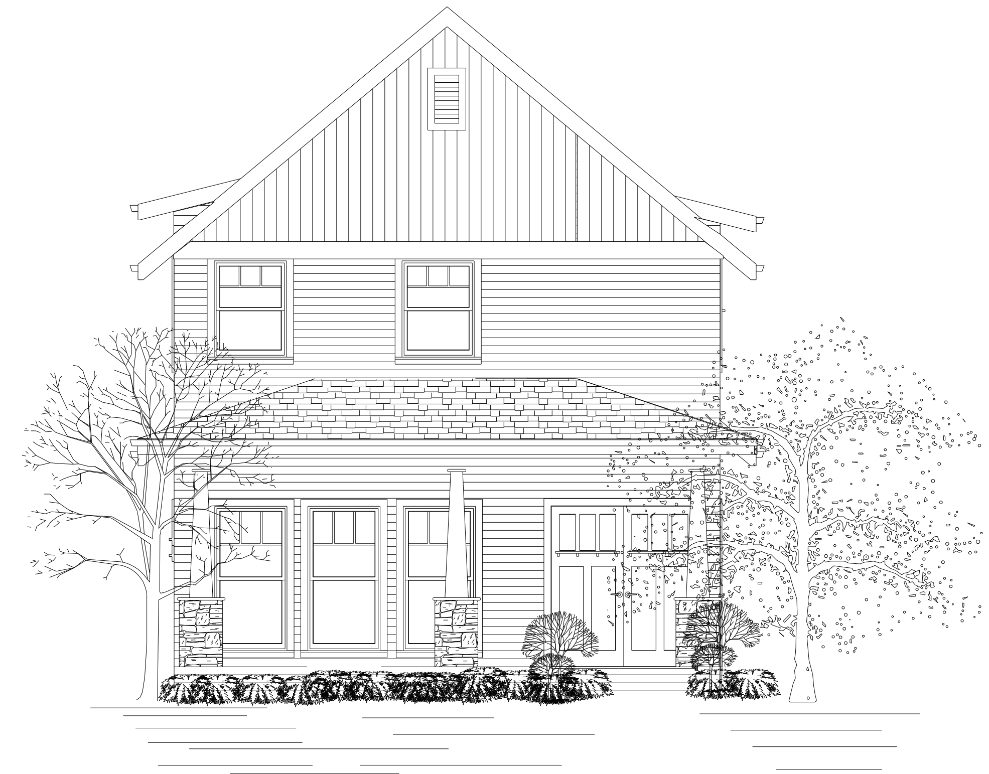
FRONT ELEVATION SCALE 1/4" = 1'-0"